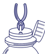
Step 2: Cut the middle part of the plug so that there is an opening for the syringe